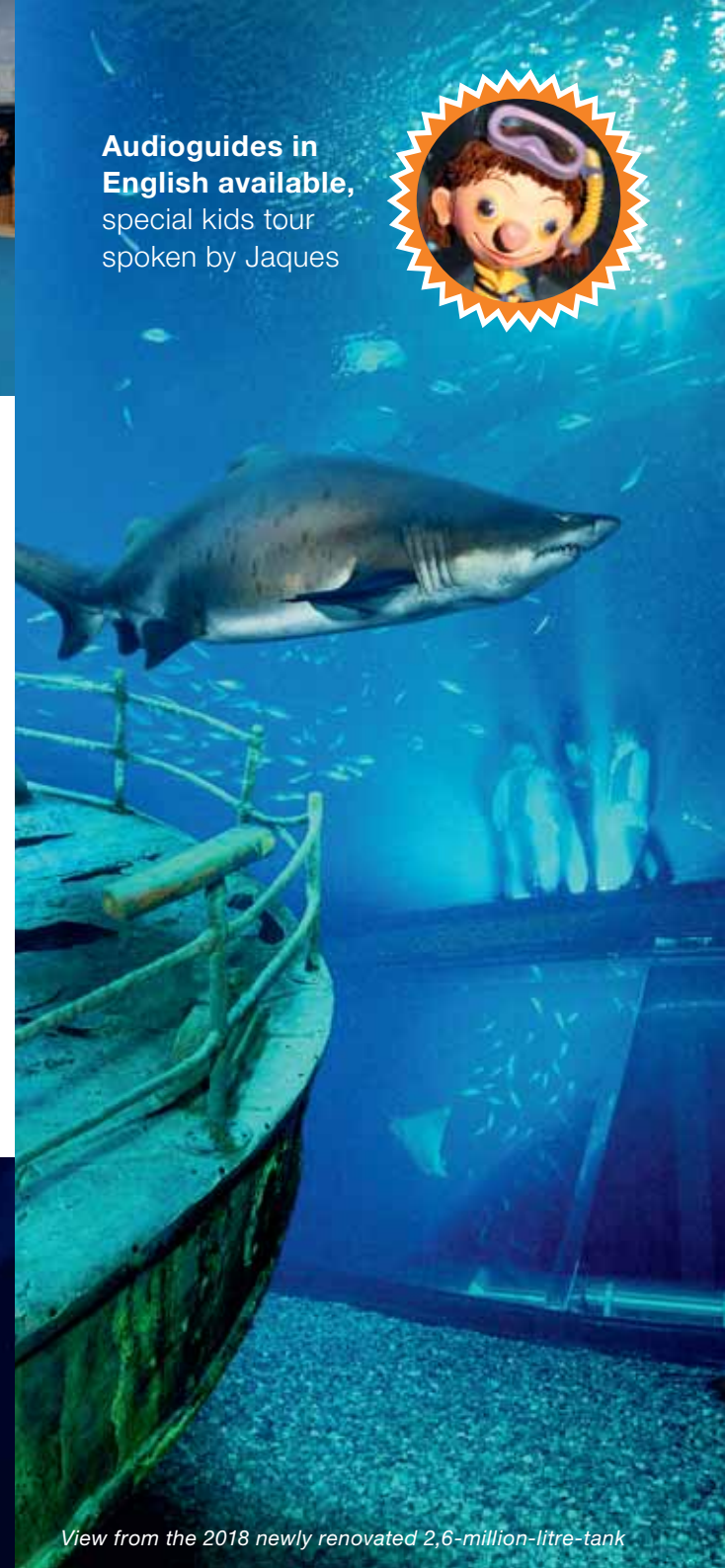
View from the 2018 newly renovated 2,6-million-litre-tank

Audioguides in English available, special kids tour spoken by Jaques