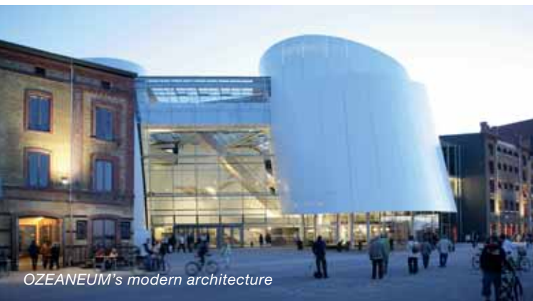
OZEANEUM's modern architecture

Hint: Get carried away in front of the herring pool