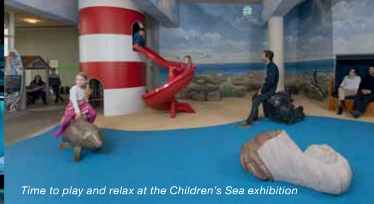
Time to play and relax at the Children's Sea exhibition