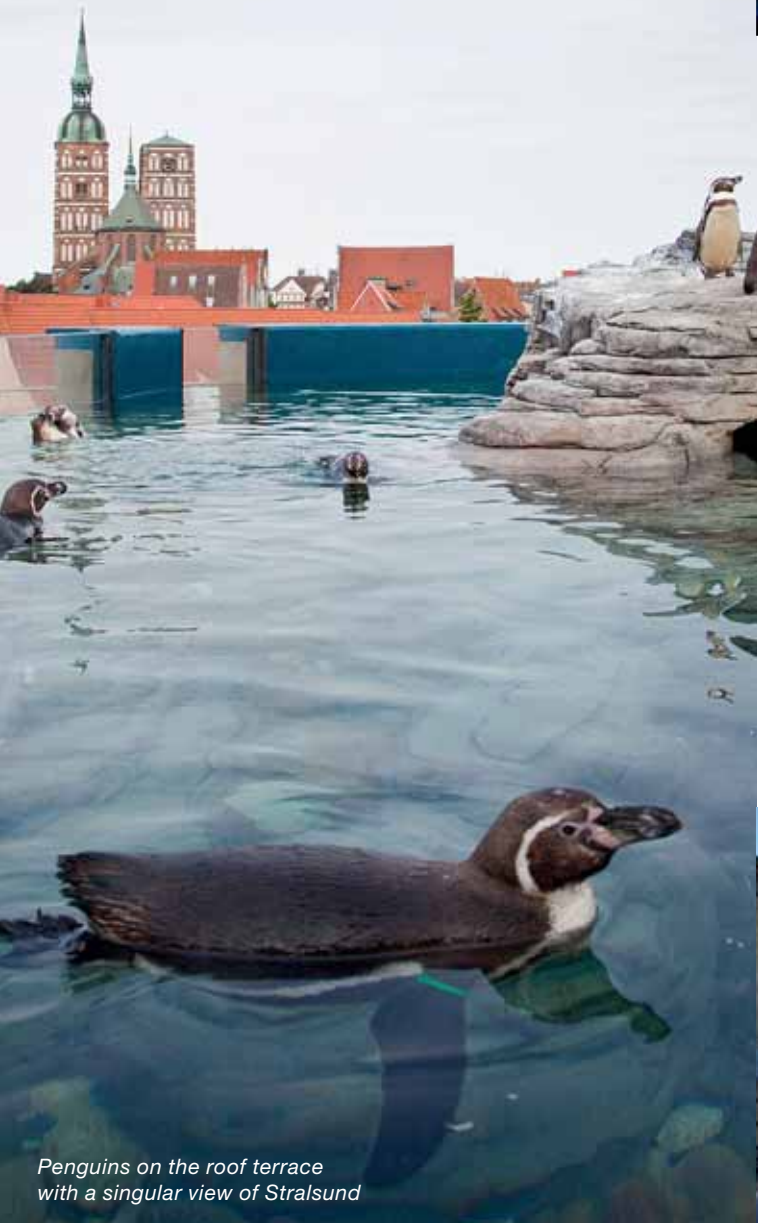
Penguins on the roof terrace with a singular view of Stralsund