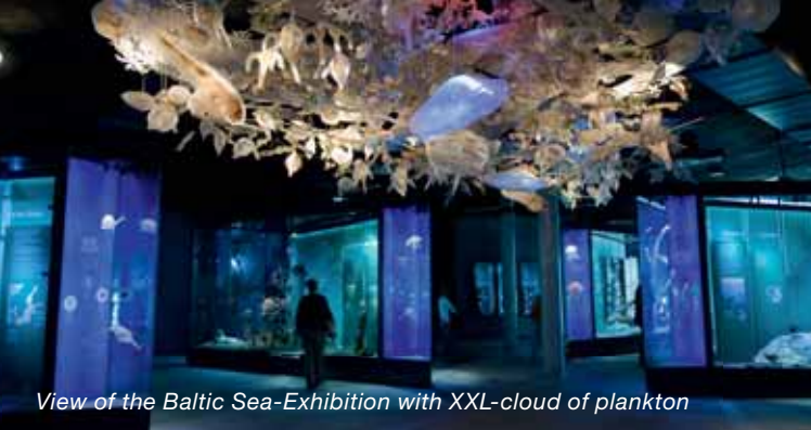
View of the Baltic Sea-Exhibition with XXL-cloud of plankton

Visit the European Museum of the Year 2010 and experience a unique underwater journey through five large exhibitions and 50 aquaria devoted to the northern seas.